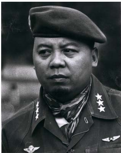
Maj. Gen. Nguyen Khanh, the military leader who would unseat the government of General Minh just three months after he had overthrown Diem.