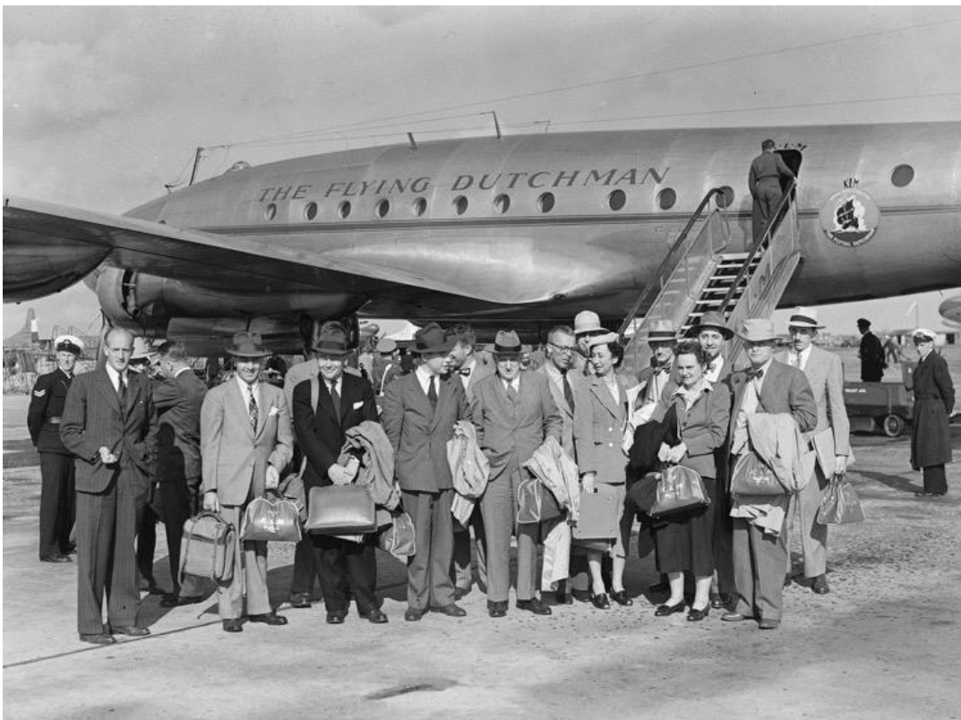
American journalists preparing to leave the Netherlands for a Dutch-sponsored visit to Indonesia, June 1949.