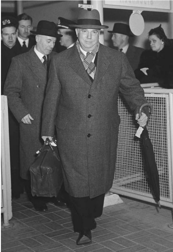
H. Merle Cochran, US representative on the GOC and the United Nations Commission for Indonesia, 1948–1949, and ambassador to Indonesia, 1950–1953.