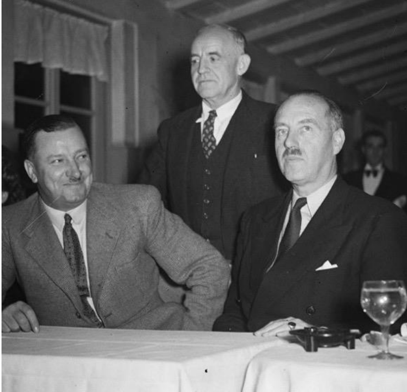
The UN Security Council's Good Offices Committee, January 1948, left to right: Richard C. Kirby (Australia), Frank P. Graham (United States), and Paul van Zeeland (Belgium).