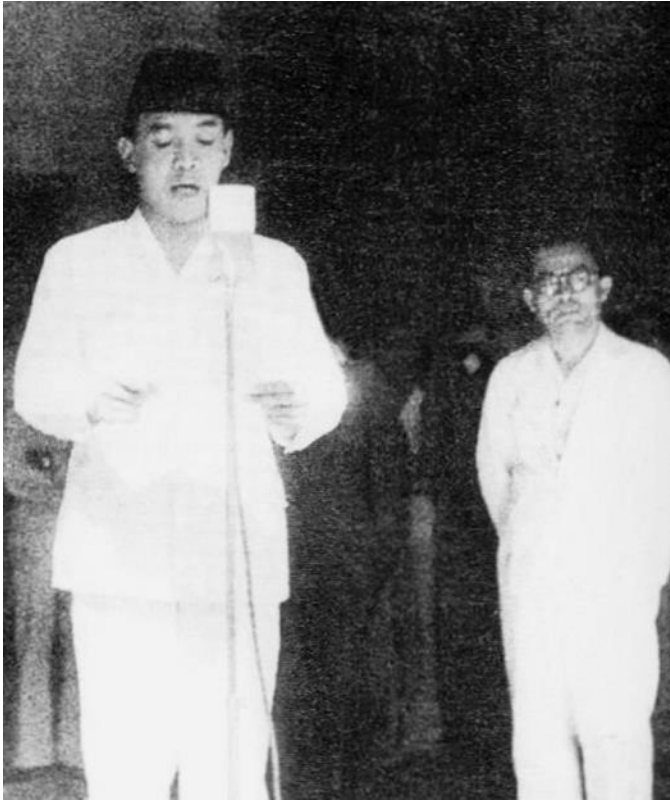
Sukarno, left, and Mohammad Hatta proclaiming the establishment of an independent Republic of Indonesia, August 17, 1945.