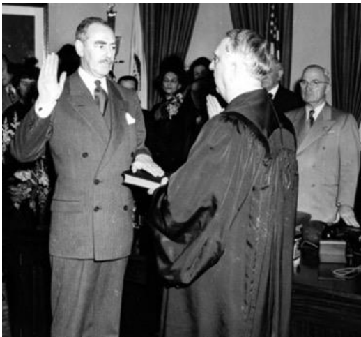
Secretary of State Dean Acheson's swearing-in ceremony, January 21, 1949.