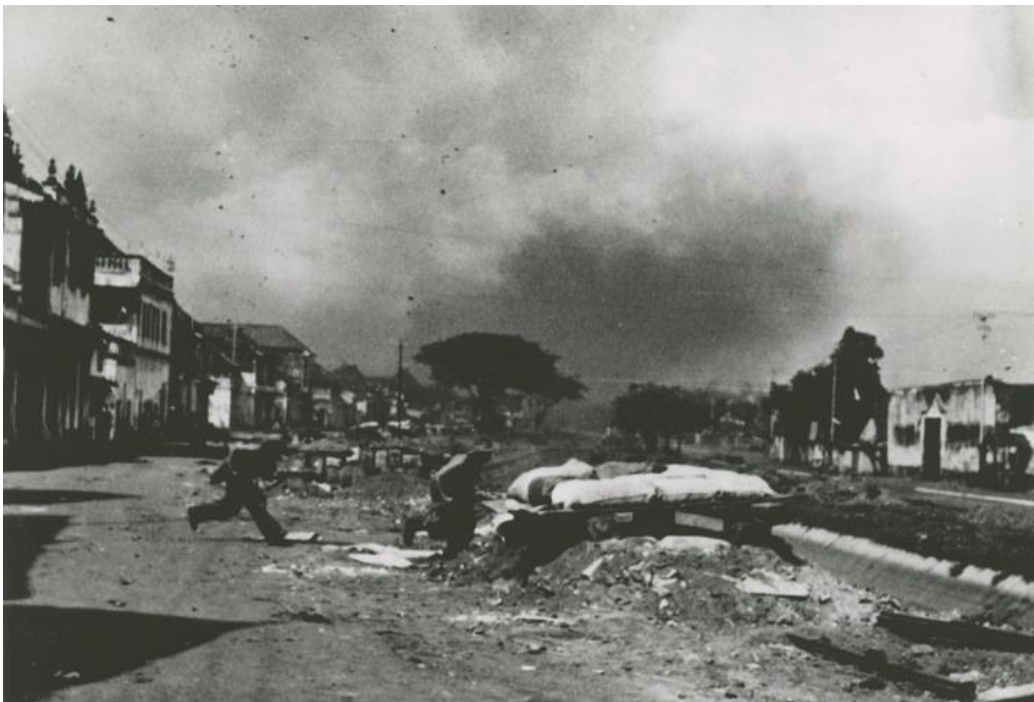
The urban warfare in Surabaya, Java, November 1945, was the most intense sustained combat of the Indonesian revolution.