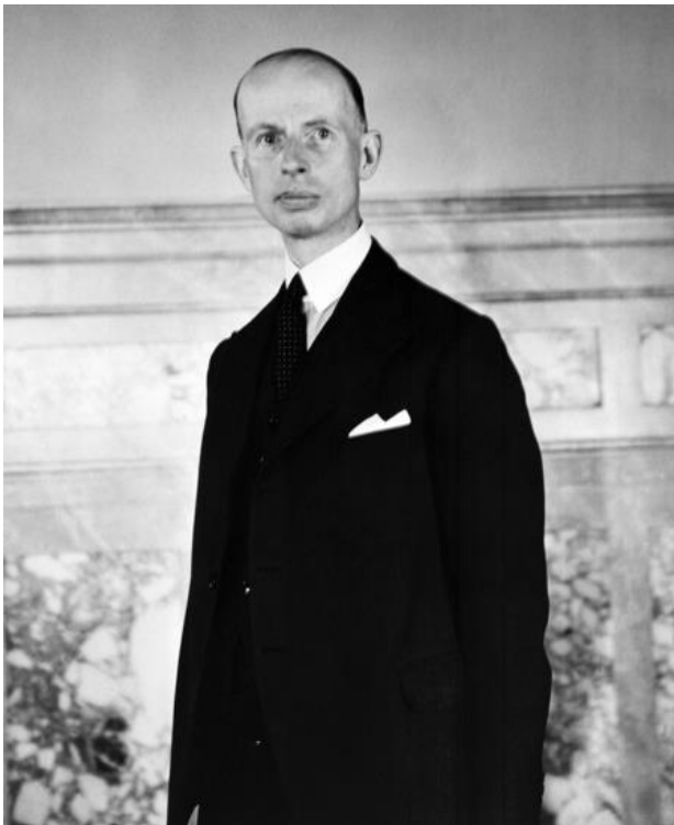
Eelco N. van Kleffens, Netherlands minister of foreign affairs, 1939–1946, and ambassador to the United States, 1947–1950.