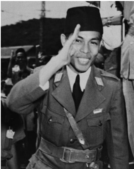
General Sudirman, commander of the Republic's armed forces, November 1946. (National Archives of the Netherlands)