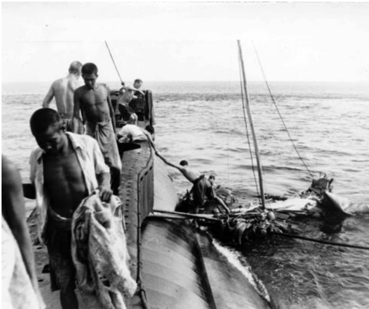
Kidnapped Indonesians during an OSS “snatch” operation, 1944.