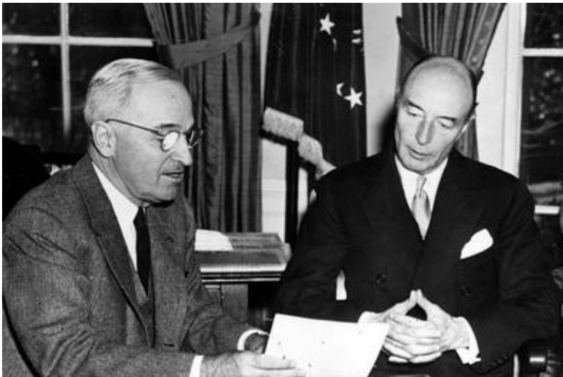
President Harry S. Truman and Robert A. Lovett, under secretary of state, July 1947 to January 1949.