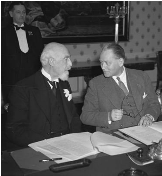
Herman B. Baruch, US ambassador to the Netherlands, left, and Dutch Foreign Minister Dirk U. Stikker, January 1949.