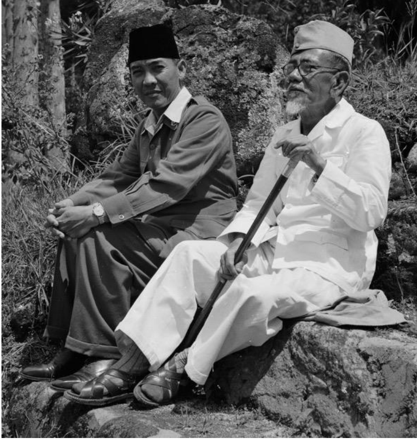
President Sukarno, left, and Foreign Minister Agus Salim, interned by the Dutch in North Sumatra, January 1949.