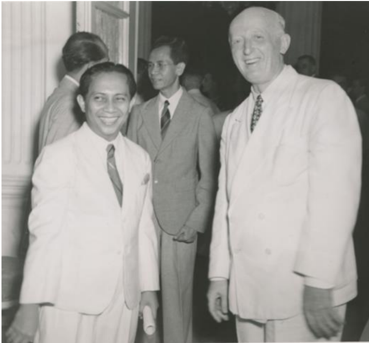
Prime Minister Sjahrir and US Consul General Walter A. Foote, March 1947.