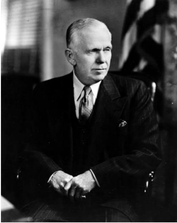
George C. Marshall, US secretary of state, January 1947 to January 1949.