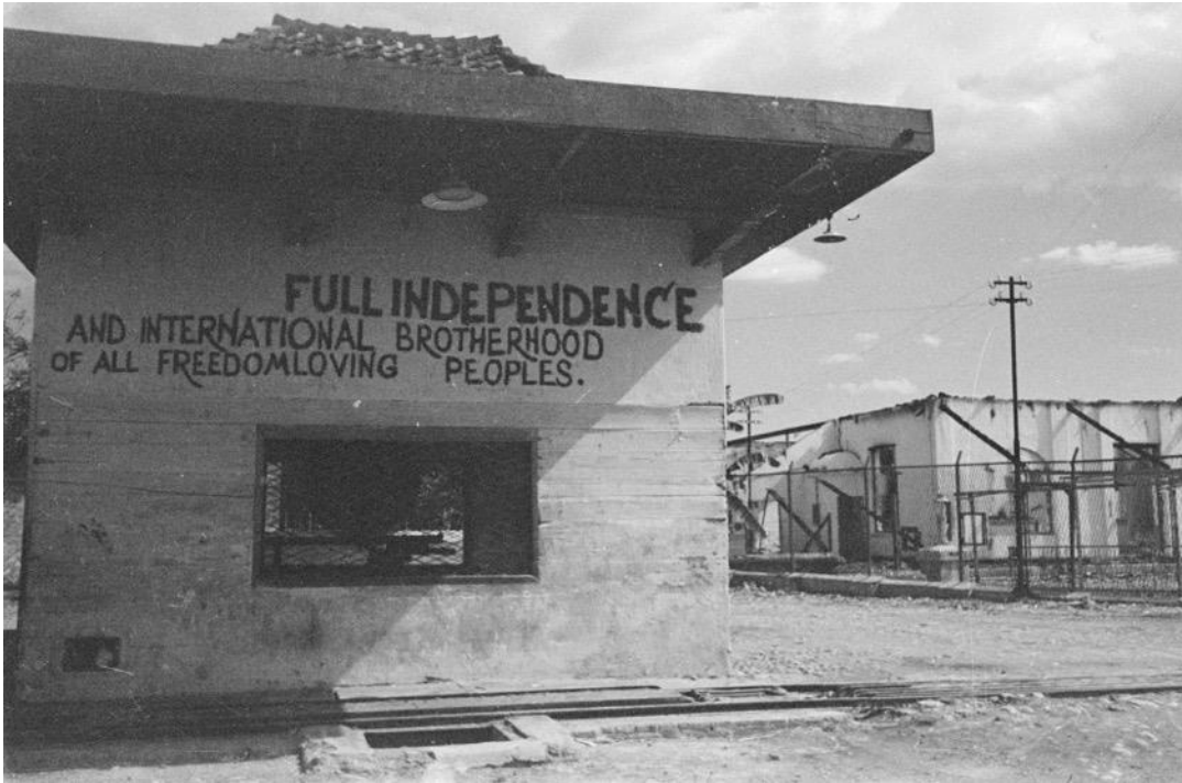
English-language graffiti in Linggadjati, West Java, 1947.