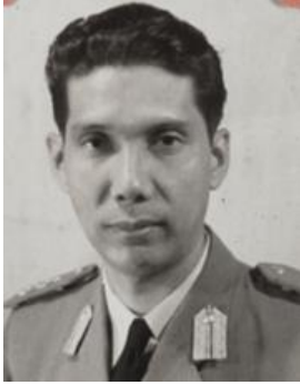
Sukanto Tjokrodiatmodjo, chief of Indonesia's national police.