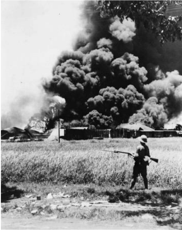
Burning oil tanks in Java during the Japanese invasion of the Netherlands East Indies in 1942.