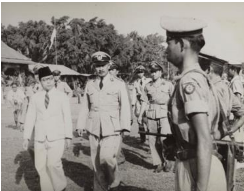
Prime Minister Hatta, left, inspecting the Mobile Brigade of the Republic's national police force, September 1948.