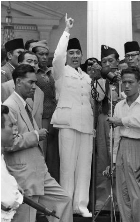
President Sukarno in Jakarta, December 28, 1949, one day after the formal transfer of sovereignty from the Netherlands.